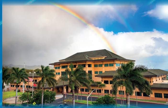
JIATF West - Camp H.M. Smith, Hawaii